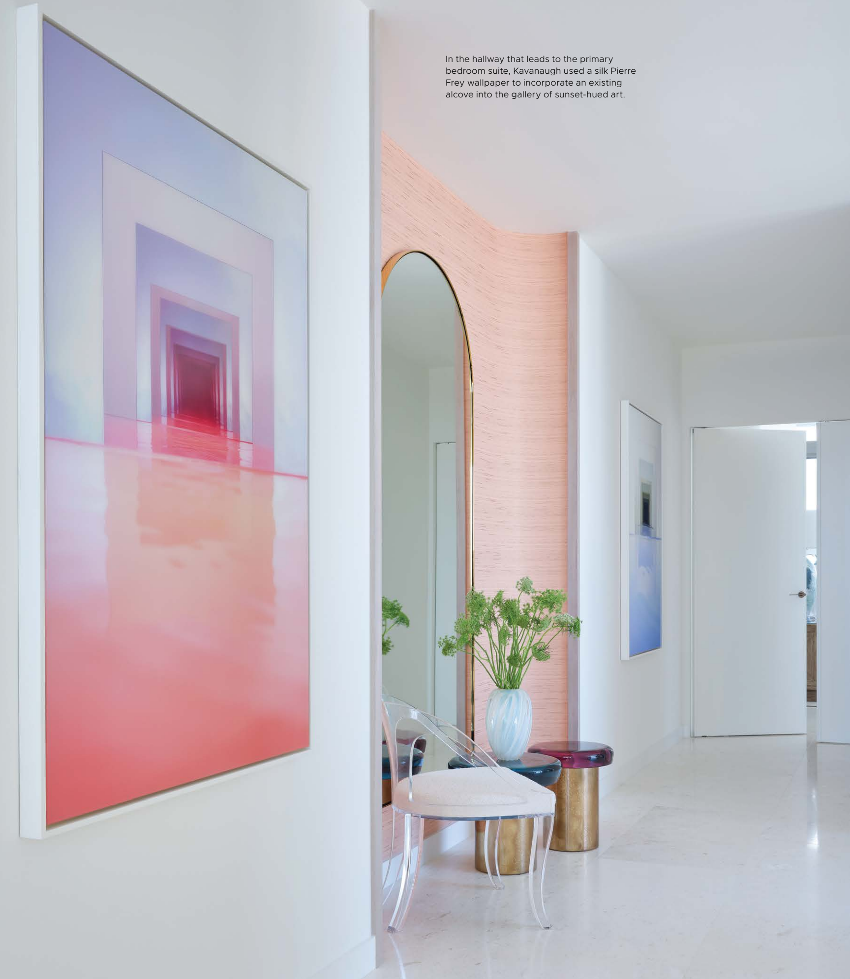
In the hallway that leads to the primary bedroom suite, Kavanaugh used a silk Pierre Frey wallpaper to incorporate an existing alcove into the gallery of sunset-hued art.