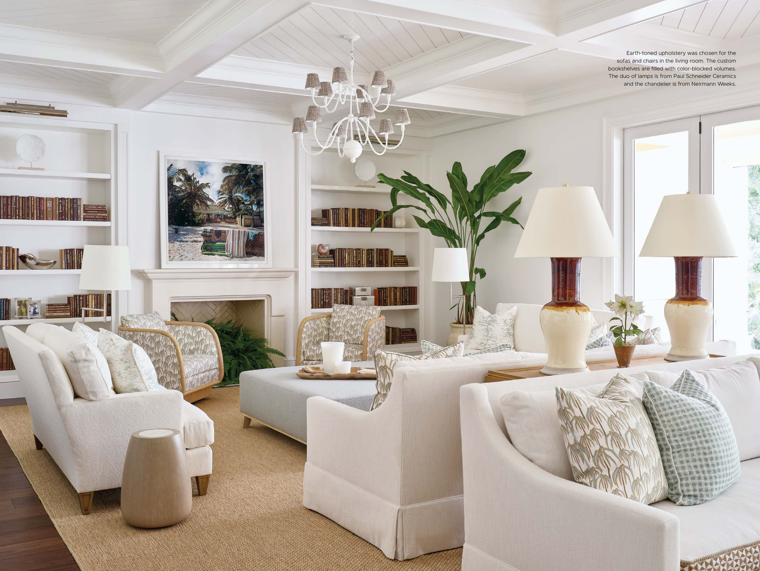
Earth-toned upholstery was chosen for the sofas and chairs in the living room. The custom bookshelves are filled with color-blocked volumes. The duo of lamps is from Paul Schneider Ceramics and the chandelier is from Neirmann Weeks.