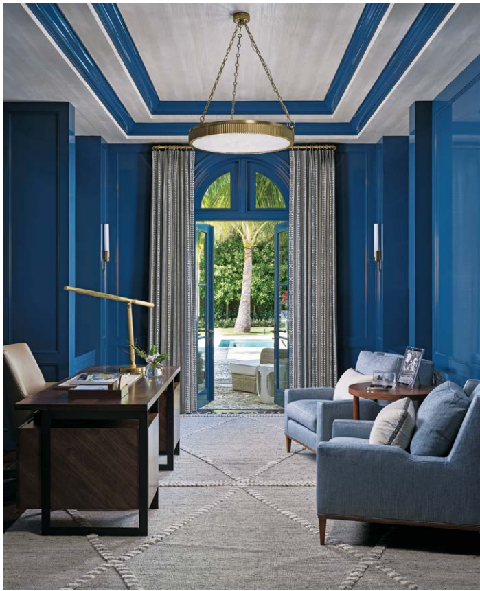
ABOVE: A hand-knotted rug from STARK Carpet grounds the office, where a herringbone-veneered desk from Hickory Chair is positioned opposite a pair of armchairs from Baker Furniture. The pared-down but handsome furnishings allow the lacquered blue walls to dominate the mood here.